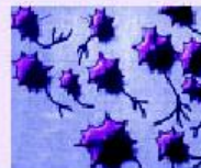
Brain cells at birth

Your baby is born with all the brain cells ever needed BUT... how these cells connect is determined by the baby's experiences in their first few years of life.